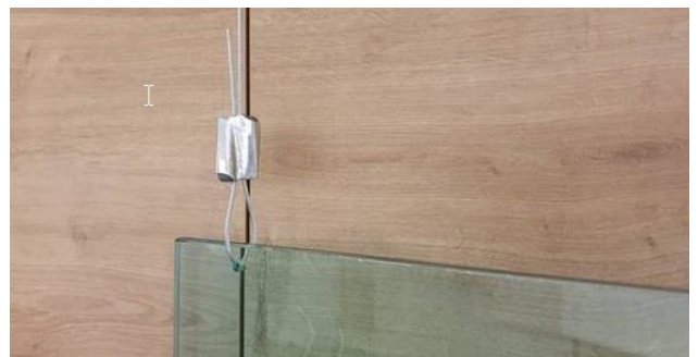
Hanger kits available for use with glass, acrylic or many other types of protective shields.