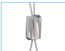
EXPRESS NO. 2 SWL: 100 lbs.